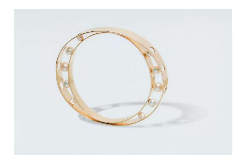
A Lia Di Gregorio 18-karat gold bracelet with pearls.

Eighteen-karat gold is Di Gregorio's starting point in her creative process. A couple of interlocked band rings feature a white pearl each, on the outer and inner sides, respectively. The item retails for 2,226 euros and is among Di Gregorio's bestsellers.