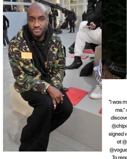
N: According to WWD sources, Off-White ıer Virgil Abloh will be named men's wear r at Louis Vuitton. See link in bio for the full story. #wwdashion #wwdnews

Aonie debuted the "Madagascar" and "Insterstellar" lineups at the VicenzaOro trade show in January. Done in 9-karat gold, the range includes necklaces, rings, bracelets and earrings embellished with natural gemstones such as lapis lazuli, malachite, rubies and emeralds and it is punctuated with tiny white diamonds.